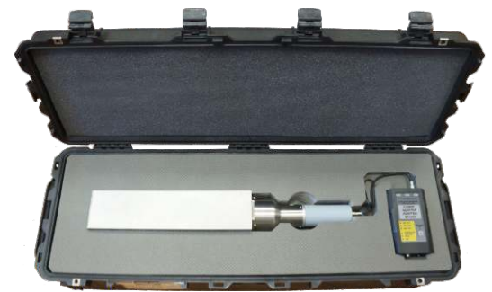
Highly sensitive gamma radiation monitor: BDKG-28 (1 unit)