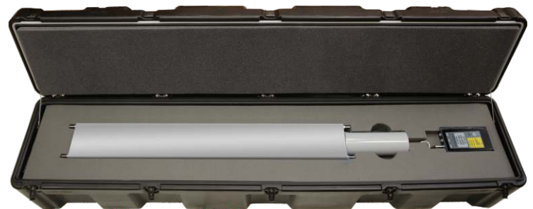
Highly sensitive gamma radiation counting monitor: BDRM-05 (1 unit)